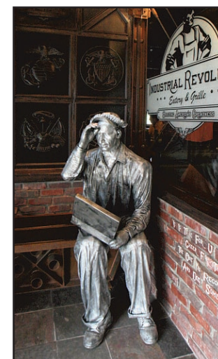
A statue salutes military, police, and fire emblems.