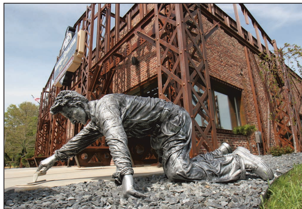
The life-sized sculpture "The Concrete's Finisher" by sculptor Sergio Furnari, outside the Industrial Revolution Eatery and Grille.