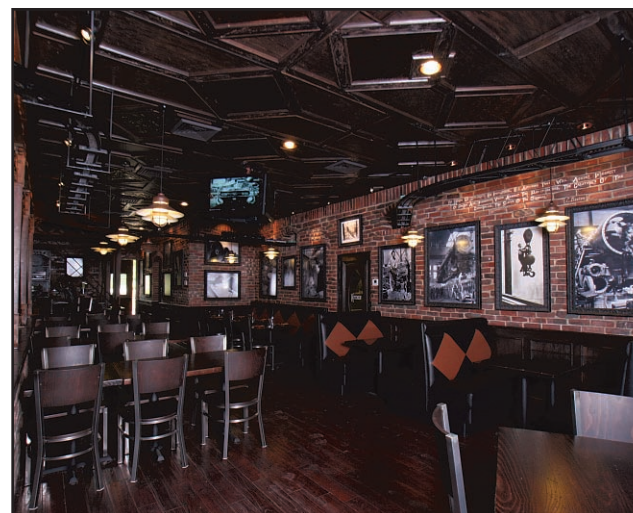
A partial view of dining area, with vintage black and white poster reproductions of steel themed photographs.